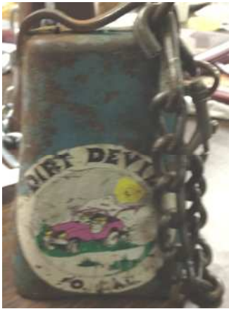
1 Old green cow bell.