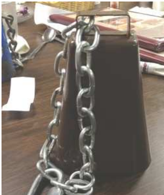
3 new brown bell