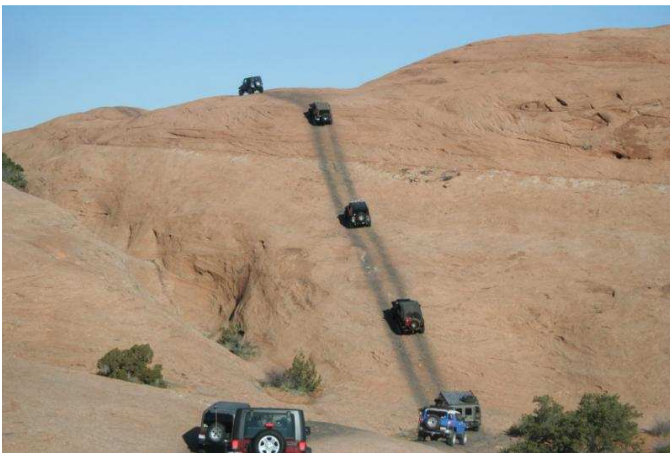
Hells Revenge Trail Moab, UT