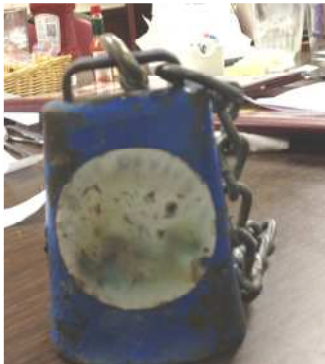
2 old blue cow bell